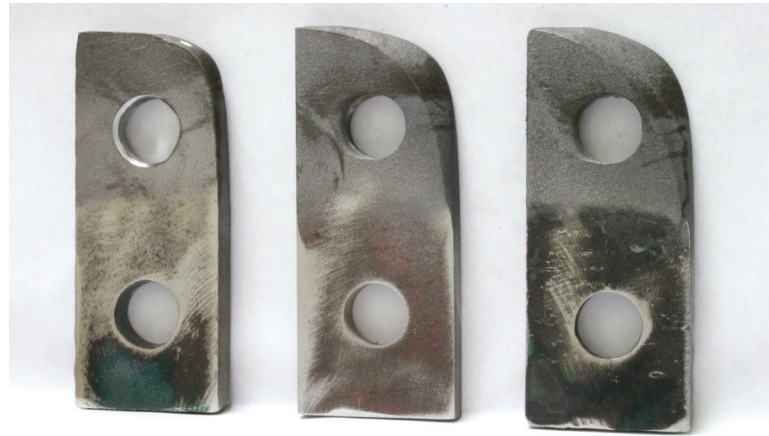
Pictured from left to right: Buffalloy, Hardox 450, AR-400.

*Independent testing conducted by Schutte-Buffalo Hammermill, an 80-year-old manufacturer of hammer mills and other grinding equipment, proved the benefits of Buffalloy in highly-abrasive environments. Testing showed that Buffalloy had a 17.2% increased wear life over Hardox 450, and a 24.8% increased wear life over conventional AR-400.