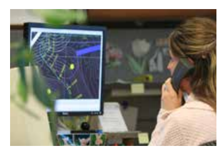
Spare Parts and Upgrades Drive Replacement (top) Engineering Services available to optimize your system(bottom)