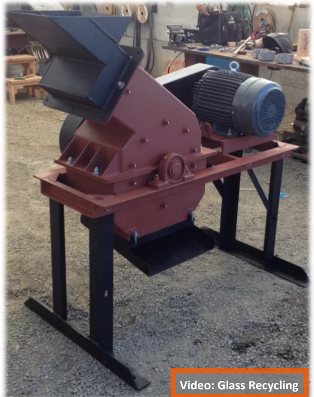
Video: Glass Recycling