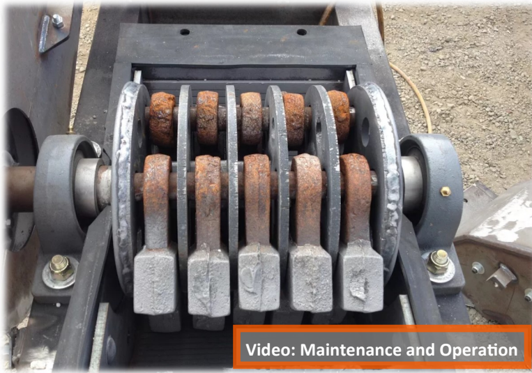
Video: Maintenance and Operation